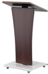
Code LEXYZ20-C (Curve)